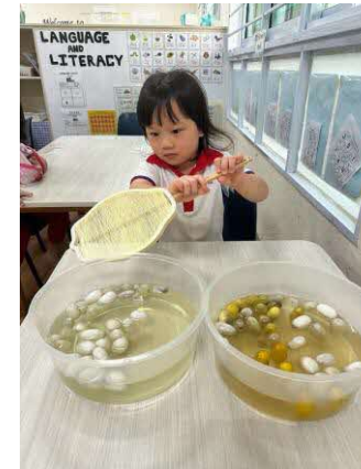
2024 Silk Fan