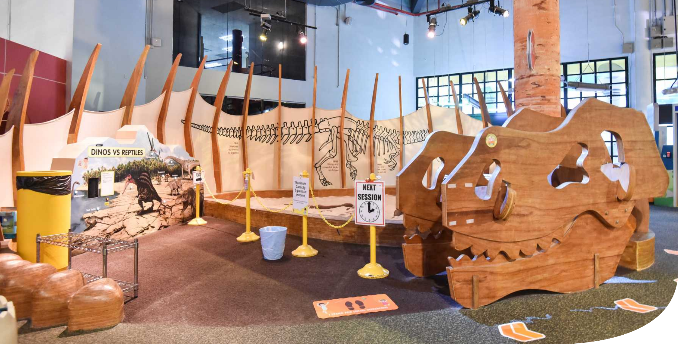
This is Dino Pit.