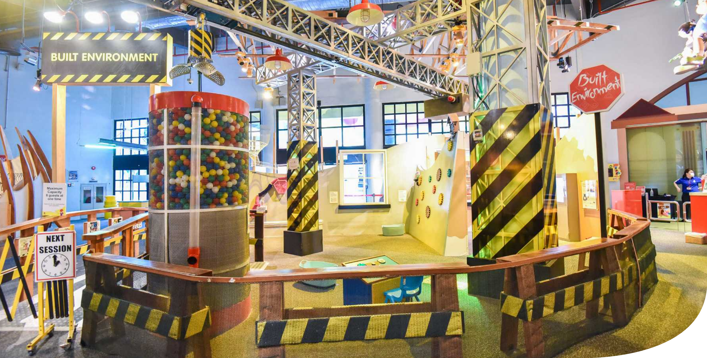
This is Built Environment.